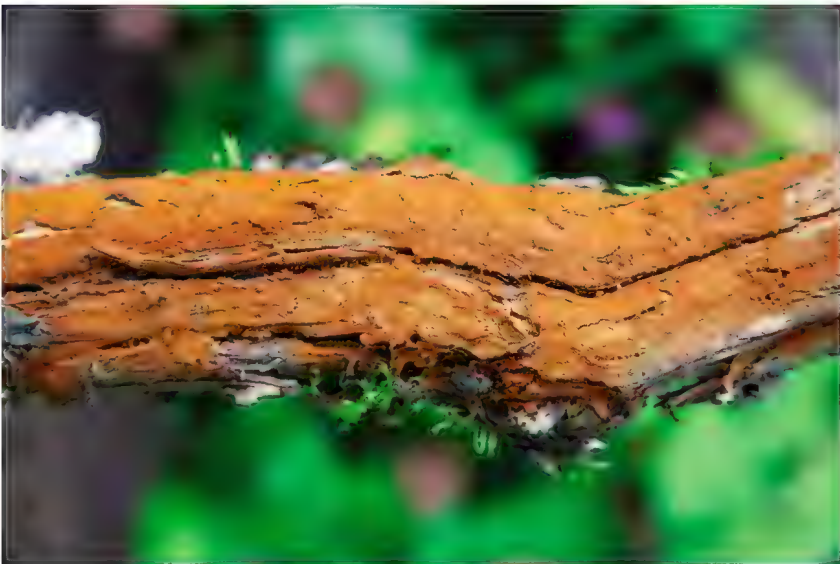
FIG. 3. Fruitbody of Hymenochaete acerosa (He 344, holotype).

ETYMOLOGY acerosa , refers to the acerosae setae.